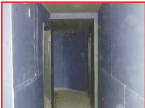
"Wear resistant" 5/8" dry wall in the hall leading to the third floor new dorm. This grade of dry wall is being used in all public areas in the house to minimize wear and tear.