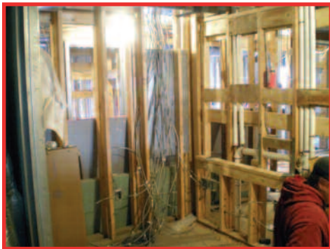
Electrical wiring is being installed in the second floor computer room.